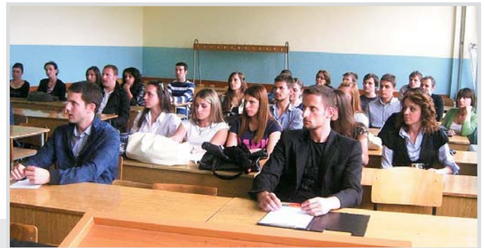
Students during the lecture