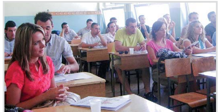
Students during the lecture